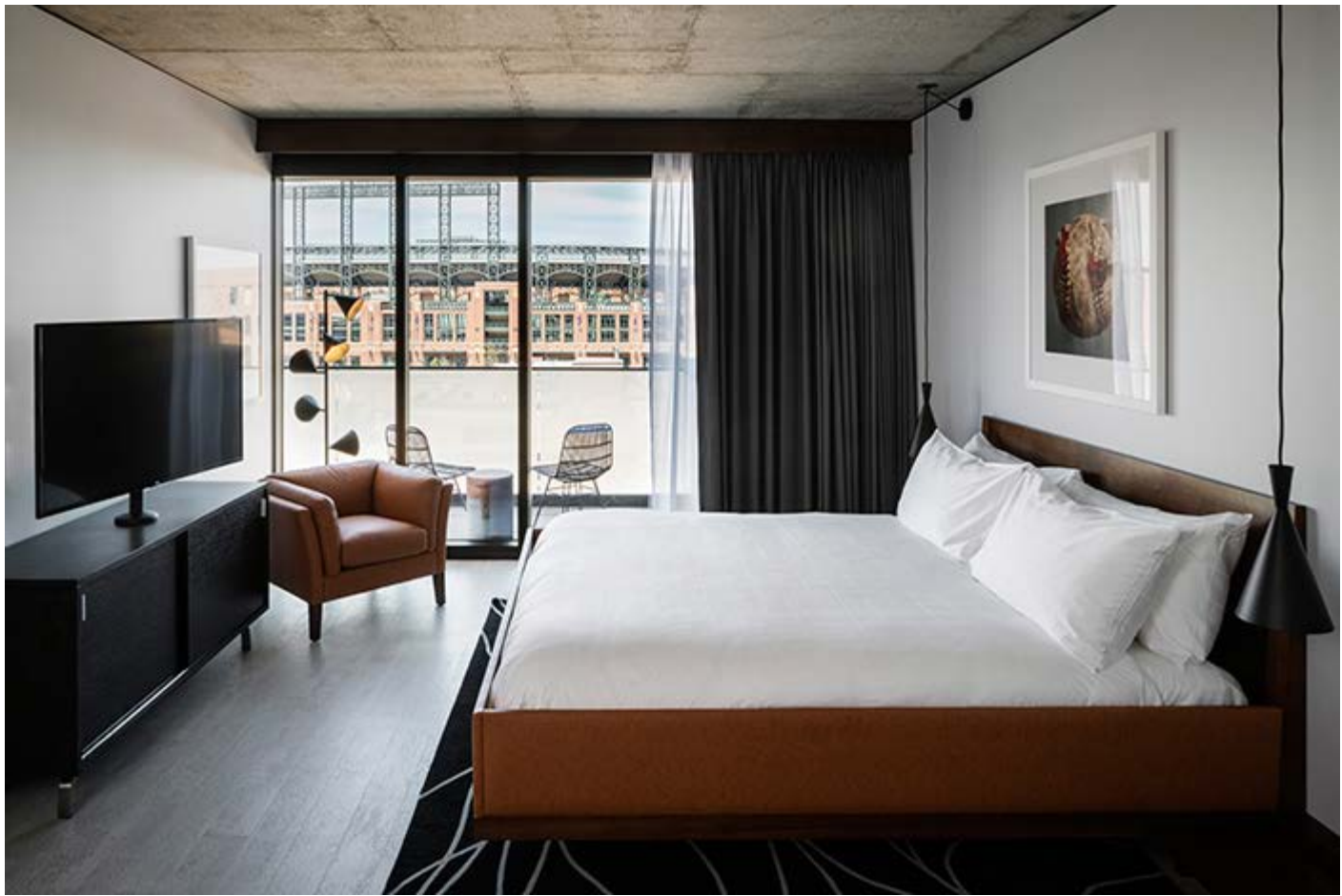
The Diamond Suite bedroom