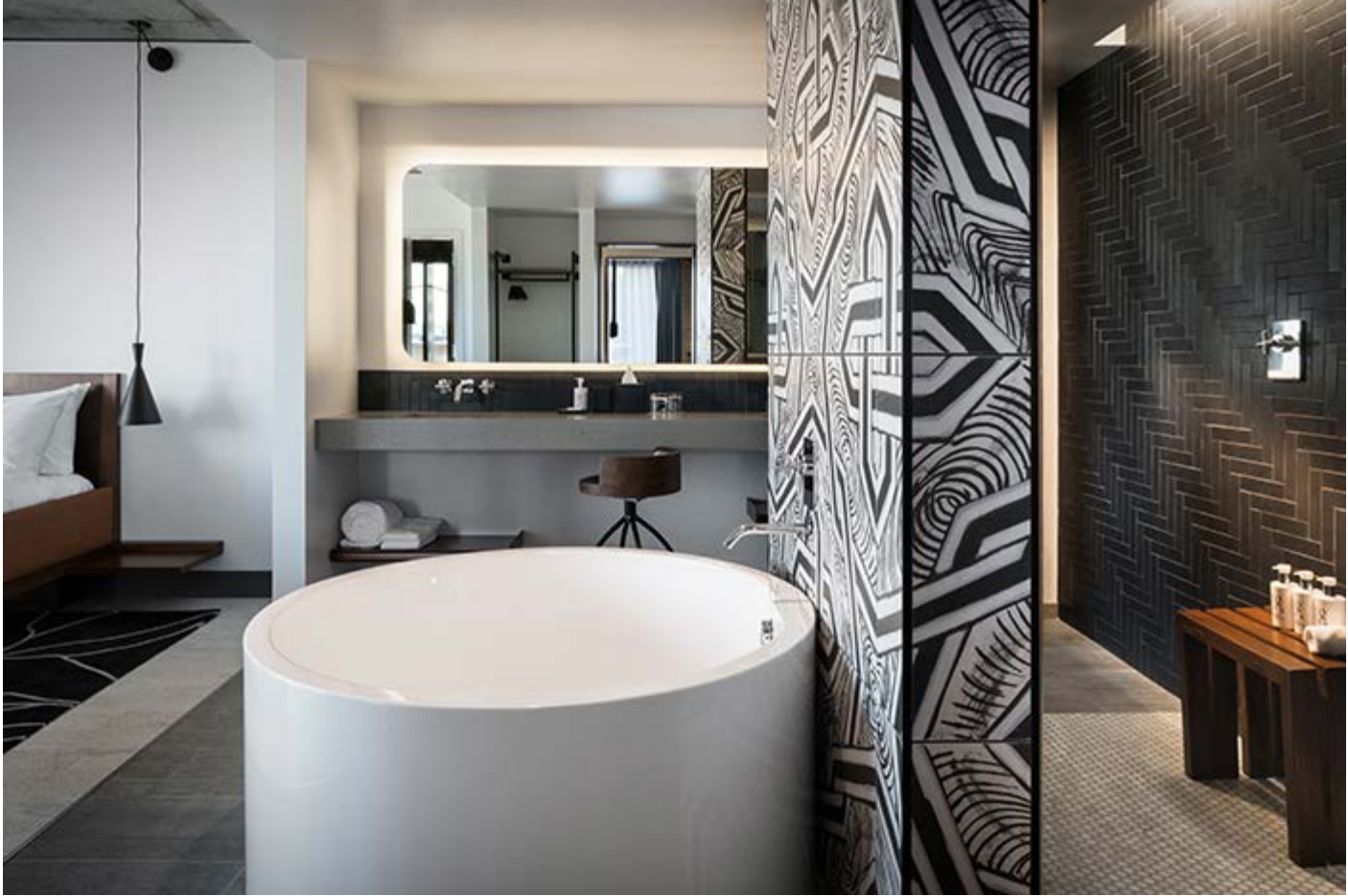
The Diamond Suite bath

It was the concept of creation—specifically, people creating things—that inspired the architects and designers at JNS | Johnson Nathan Strohe and NINE dot Arts . Both of these Denver-based companies joined McWhiney and Sage Hospitality to develop The Maven.