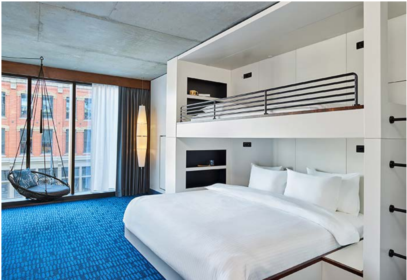
The Bunk Room

While The Maven honors the worker, there are hints of whimsy throughout the property, including chairs suspended from the ceiling and artistic rendering of foxes that represent the wild and magical way animals, including humans, adapt to their environments.