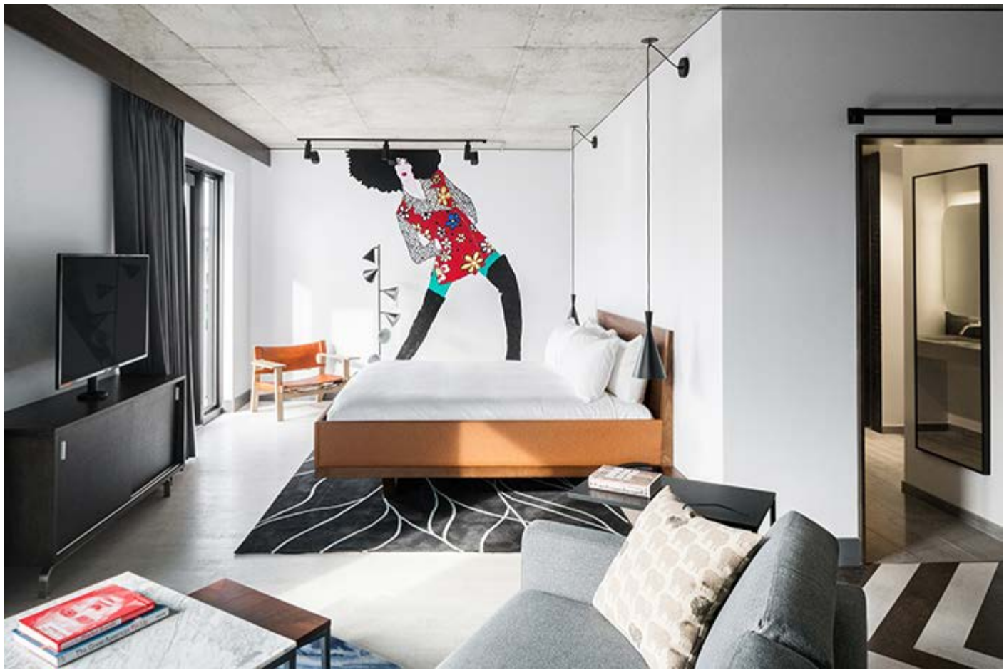
The Innovator Suite

This hotel is an ode to Denver's former glory as a working man's town where trains ran daily and much of the city's population worked with their hands. It's also a nod to those who are attracted to Denver today; the artists, makers and entrepreneurs who represent the modern day settlers of the Rocky Mountain West.