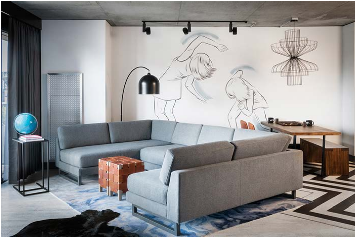
The Loft Suite

The interior design of the 172-rooms at The Maven is crisp and clean. Described as “industrial-chic,” they are a true escape from the things in life that tend to distract us, but this doesn’t mean that the rooms aren’t comfortable, comfort is extremely important and even the rooms with large patios feature comfortable outdoor furniture.