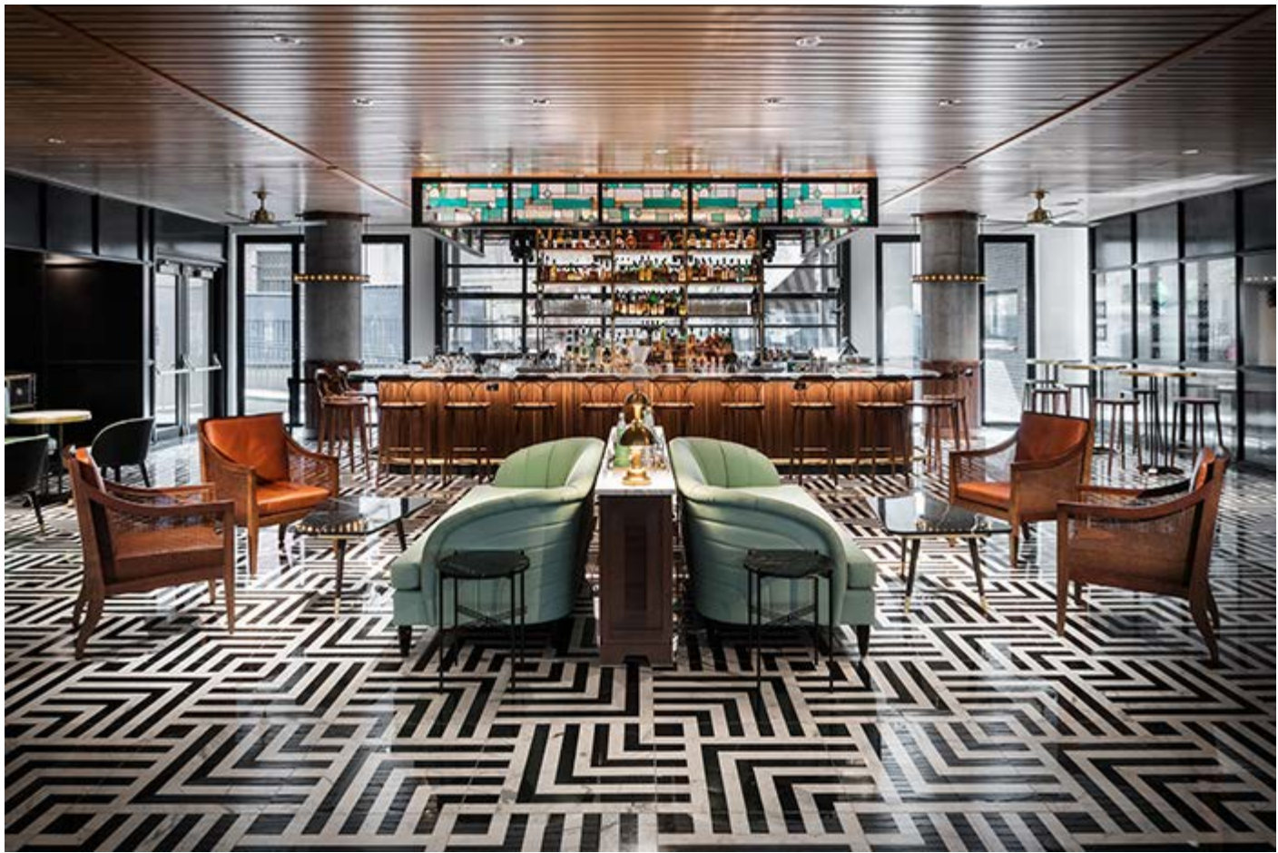
The Poka Loca Social Club