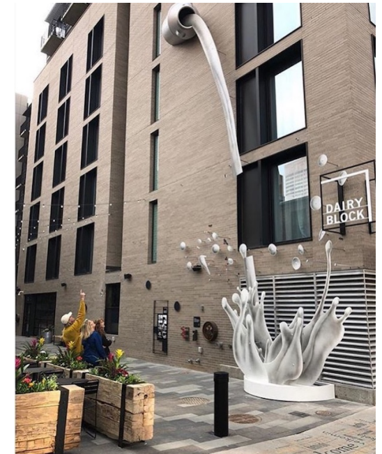
Dairy Block Spilt Milk

CTRL Collective , a shared workspace and creative campus, is also now open in the Dairy Block office tower. The 43,000-square-foot space offers a variety of communal work spaces and private offices starting at just $79 per month.