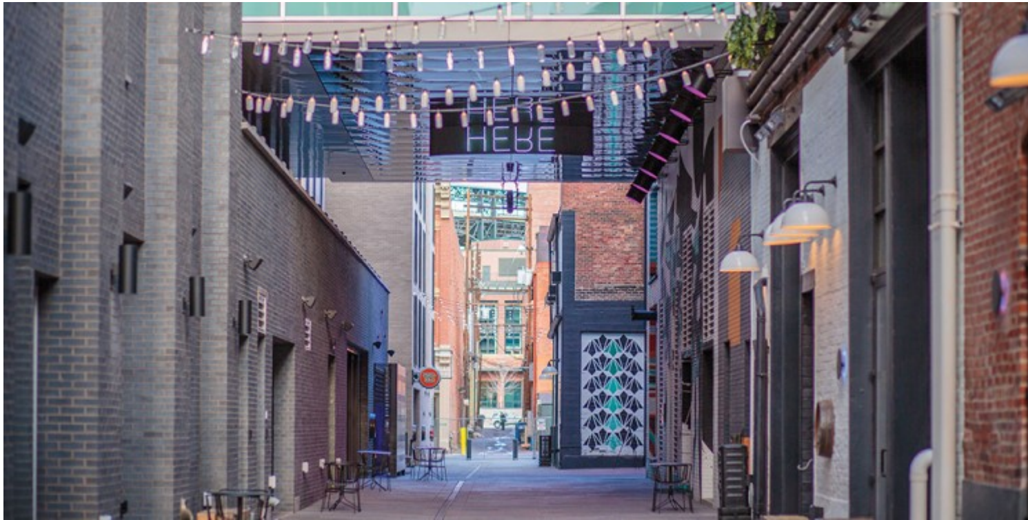
📷 Dairy Block's activated alley

DENVER – Six additional restaurants, retailers and bars have signed on to join Dairy Block , Denver's vibrant new micro-district in the heart of LoDo.